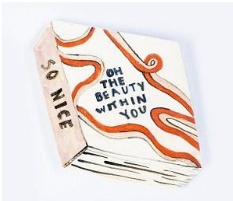
Sekar Puti some reading for self love , 2017 ceramic, various dimensions