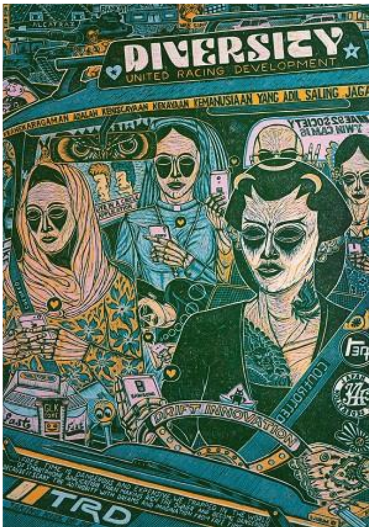
Mohamad 'Ucup' Yusuf On the way , 2018 reduction woodblock print, Edition 6 90 x 61 cm