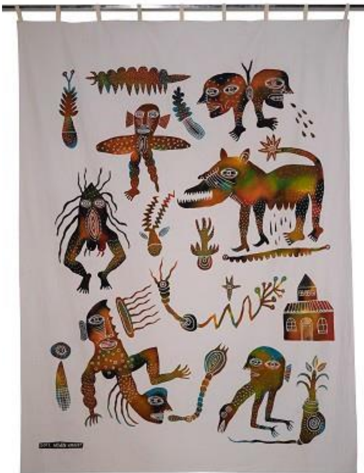
Arwin Hidayat Kadang malam kadang siang #3, 2016 batik on primisima 196 x 147 cm